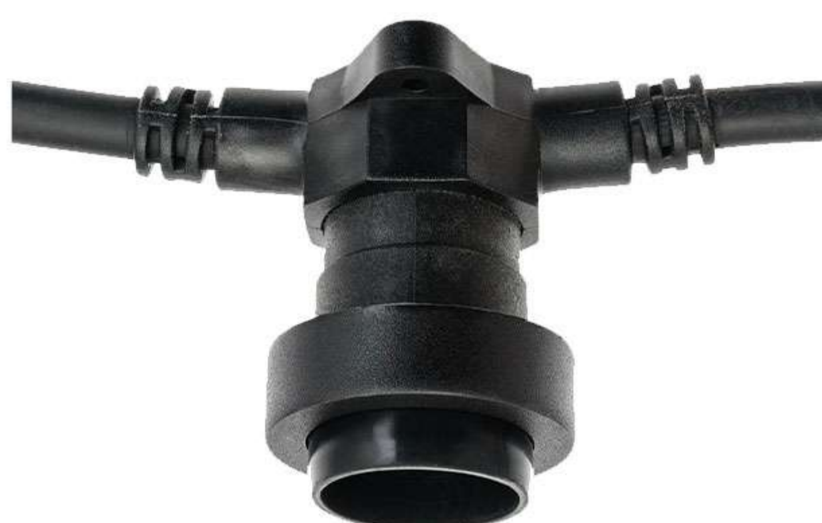
RUBBER SEALED WEATHERPROOF SOCKET

Professional-grade festoon lights harness with 100 B22 lamp holders spaced evenly along a robust 50-metre black rubber cable. Designed for versatility and large-scale use, it allows you to fully customise your display with a wide range of B22 LED bulbs (sold separately), including warm white, coloured and decorative options. The harness is built for indoor and outdoor installations, with a durable construction and IP44 rating to withstand unpredictable weather. Ideal for creating personalised lighting across long runs, this festoon harness delivers dependable performance and a clean, professional finish for any occasion.