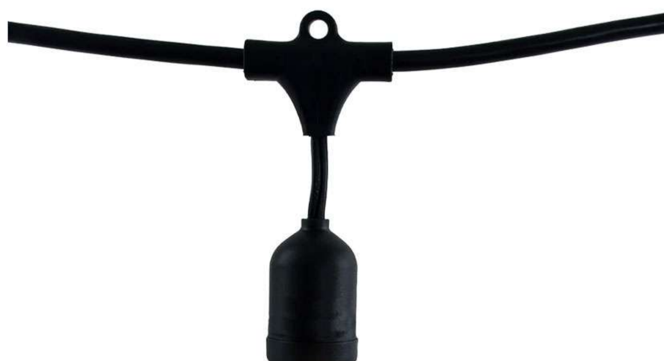
CLASSIC DROP LAMP HOLDER DESIGN